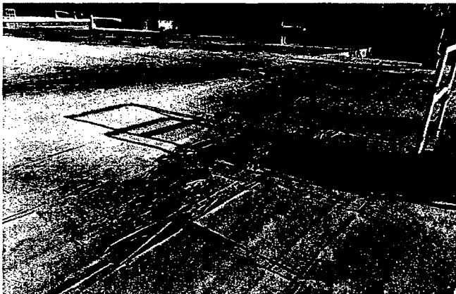
Priority Roof/Envelope Projects/Mechanical Projects